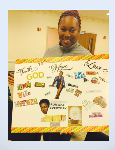
Parent visioning session

The Cradle to Career Collaborative worked with a graduate student team from Michigan State University in the fall of 2016 to research and learn about parent engagement frameworks. The group collectively created a set of questions to pilot with a small focus group of parents from eastern Washtenaw County. The focus group was conducted in late December 2016, and both the process and content of the qualitative data collection are being refined. Work with the Parent Cafés, organized by the summer 2016 100-day challenge team, has prompted the continuation of monthly parent engagement discussions in the MacArthur Blvd. neighborhood. The team is exploring replicating and designing next steps with a parent engagement framework.