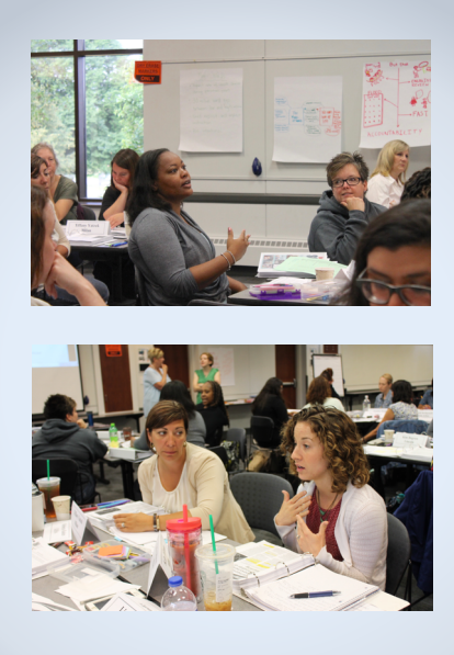
SOEL Summer Institute 2017

Strategy 2 (a) Expand and Sustain the Study of Early Literacy (SOEL) work for our early elementary teachers and (b) Explore ways to expand SOEL to include additional early childhood administrators and teachers.