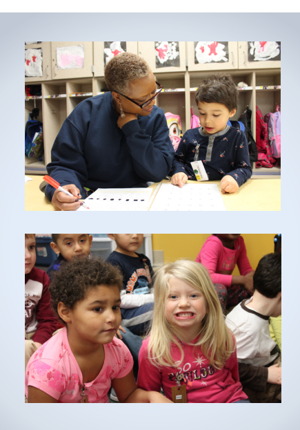
Ann Arbor Preschool students

Team members from the WISD and Livingston ESA Early Childhood and Achievement Initiatives Departments continue to develop strategies to share early childhood outcome data collected on prekindergarten children enrolled in Head Start and Great Start Readiness Program (GSRP). All Head Start or GSRP programs in Washtenaw and Livingston Counties utilize either the Teaching Strategies GOLD or HighScope's COR child outcome assessment systems and both counties now utilize the ChildPlus Head Start data management system. The team has been working to collect child outcome data from these systems into a data warehouse (Illuminate) that can be accessed by early elementary teachers and administrators in LEAs. Illuminate will also house elementary outcome and testing data on students, so that longitudinal assessment of students who participated in pre-k interventions can be conducted.